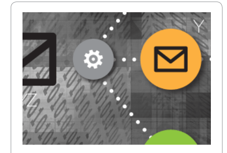
Our software prepares your mailing to Canada Post™ specifications.

Letter Carrier Presort (LCP) sequencing is the normal method by which mail is prepared if it is to be sent using Canada Post<sup>™</sup>'s Admail<sup>™</sup> or Publications Mail<sup>™</sup> rates. LCP sequencing is a computer-driven process that prepares files of names and addresses so that actual pieces of mail can later be "presorted" when shipped to a Canada Post<sup>™</sup> intake facility. JSI offers LCP sequencing using JSI Presort, software written by JSI and recognized under SERP (Canada Post<sup>™</sup>'s Software Evaluation and Recognition Program).